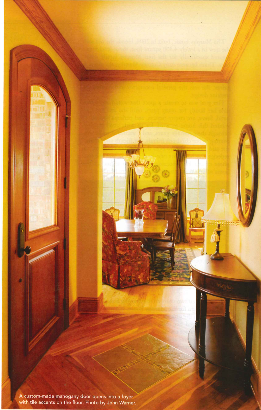
A custom-made mahogany door opens into a foyer with tile accents on the floor.

An arched opening leads to the heart of the house — a great room, kitchen and eat-in nook, spaces that flow effortlessly due to an open floor plan and use of the golden wall